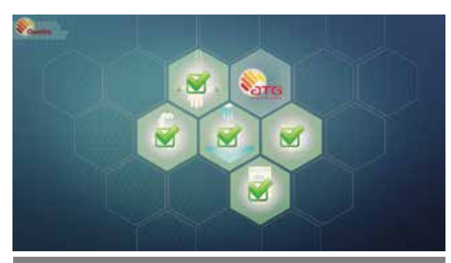
We operate a zero-outsourcing policy. We exercise 100% control and strictly monitor each step of the manufacturing process at all times. We do it all.