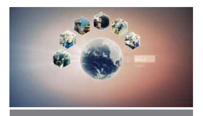
Each day, workers perform physical and labour-intensive tasks and operations in an environment that exposes them to factors which may affect their safety and comfort. This is where ATG<sup>*</sup> can lend a hand.