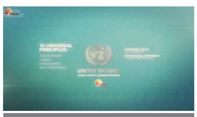
On a larger scale, we are also a participant in the United Nations Global Compact leadership platform: a strategic policy initiative for businesses that are committed to implementing and disclosing sustainable corporate policies and practices.

We spare no effort in making sure that the ATG<sup>*</sup> glove experience is a gentle one, both for the user's skin and for the planet. Our gloves are 100% allergy tested and dermatologically accredited, and can therefore be considered to be the "skin-friendliest gloves on the planet".